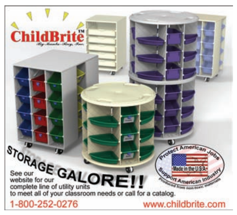
Circle 27 on Product Inquiry Card